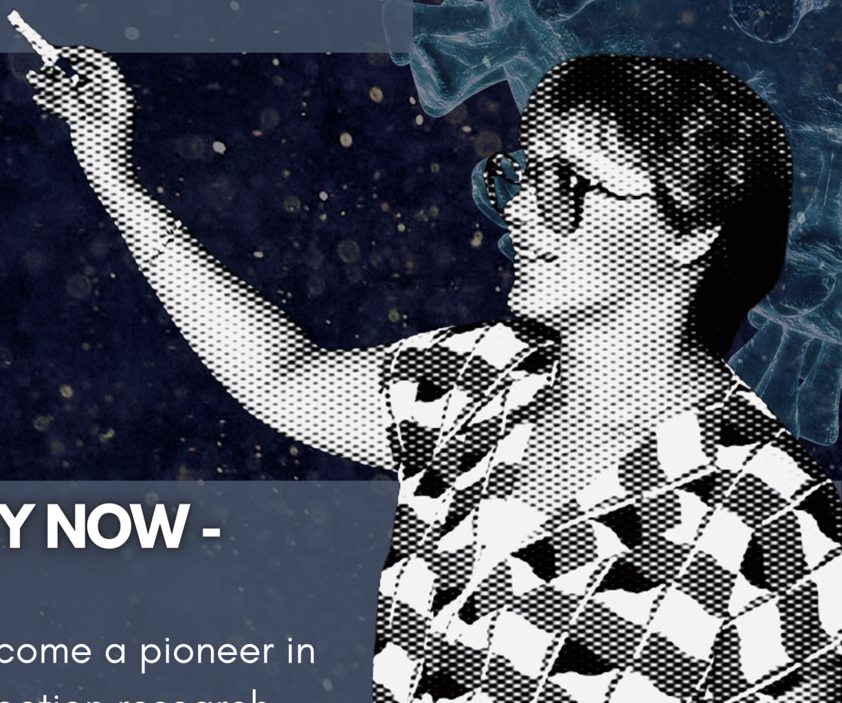
FRANÇOISE BARRÉ-SINOUSSE, PHD CO-DISCOVERER OF HIV