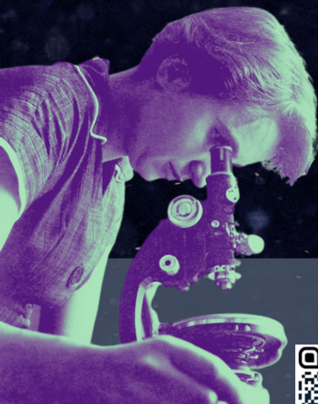
ROSALIND E. FRANKLIN, PHD CO-DISCOVERER DNA DOUBLE HELIX-

Become a pioneer in infection research www.helmholtz-hzi.de